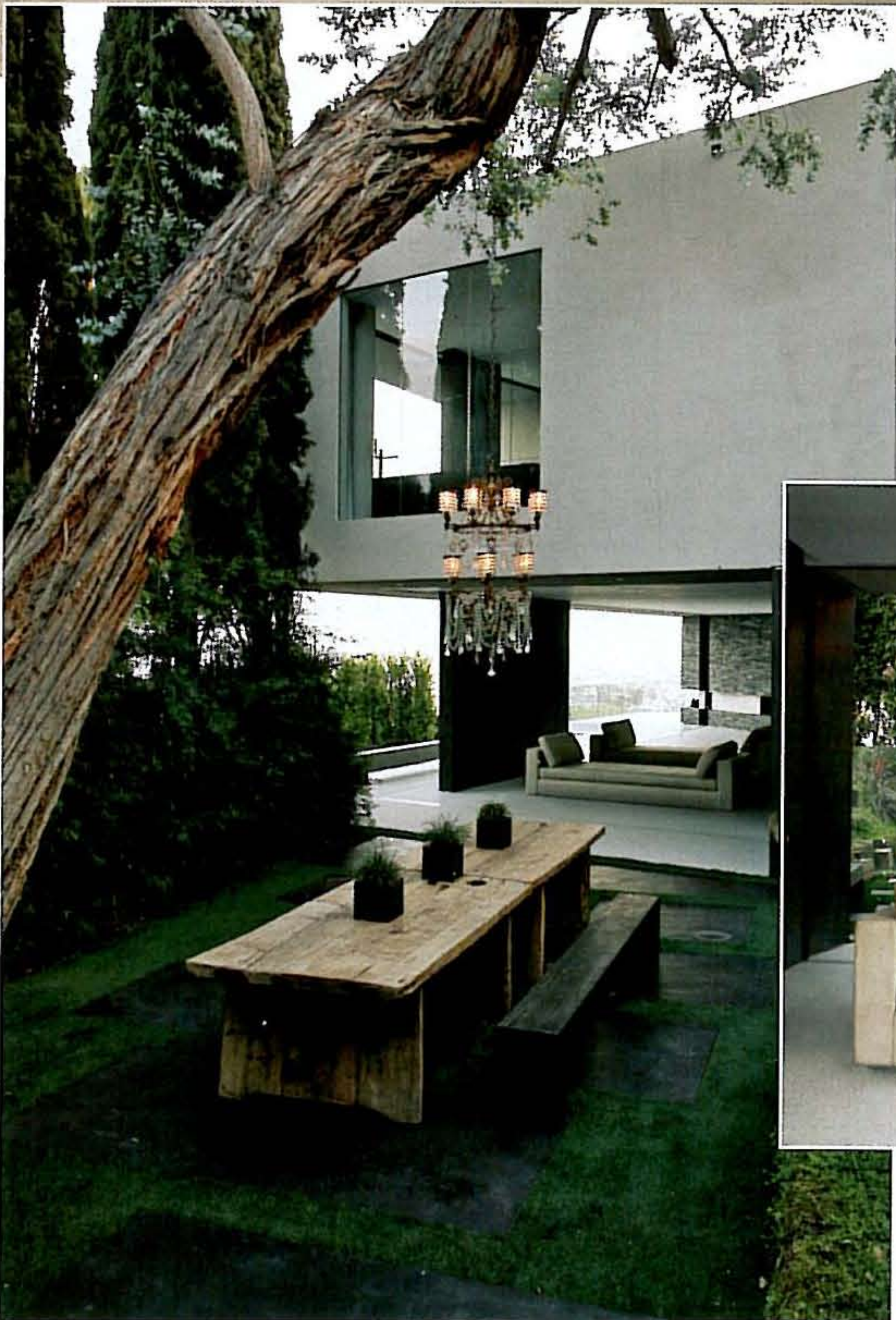
LEFT: The texture and design of a wooden table and bench contrasts sharply with the rigid lines of the house and a chandelier hanging from the tree.